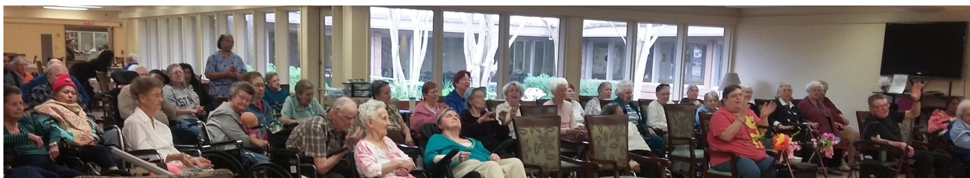
Salvation Army's Winds of Change Choir brings out crowds at SJH. Annually, they show their love through uplifting songs of praise and we are all the better for it.

At SJH showing love for our residents is successfully doing our job. When volunteers come to sing, or do crafts or read to them, it shows love. Valentine's Day may seem like a holiday strictly for the retail industry, but it can be so much more. Embrace it and use it in a way that it can do the most good. Love isn't about candy, flowers or cards, but if just one or more of those things can lift, encourage, build confidence or add to self worth, what's wrong with an international 'reason to love'? ✚