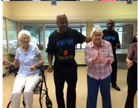
Residents got their groove on with the Salvation Army Harbor Light Choir.