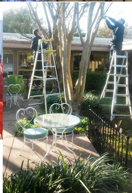
Chevron volunteers lend a helping hand.