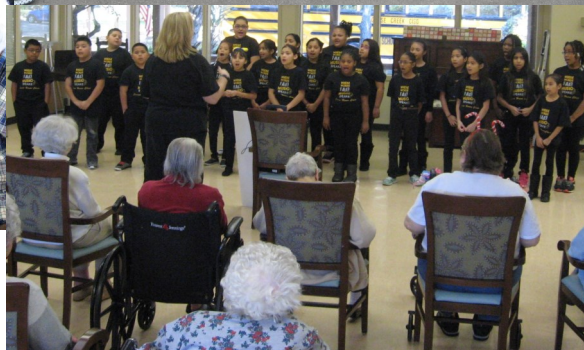
From preschool to high school, area youth came out to entertain, bring gifts and visit with our residents.