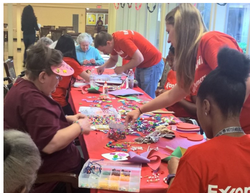
Exxon Mobil volunteers brought out the creative side of SJH residents.