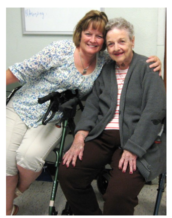
Family love and support is truly divine intervention.