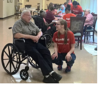
The gift of one-on-one time.