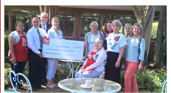
The extraordinary art of giving of time and money made a divine difference in the lives of our residents and we sincerely thank The Guild Shop and their faithful volunteers.